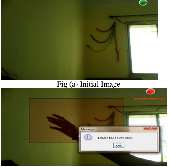
Fig:- (b) Output Image

In this experiment we use the background subtraction algorithm for the detection of the moving object in the surveillance area.